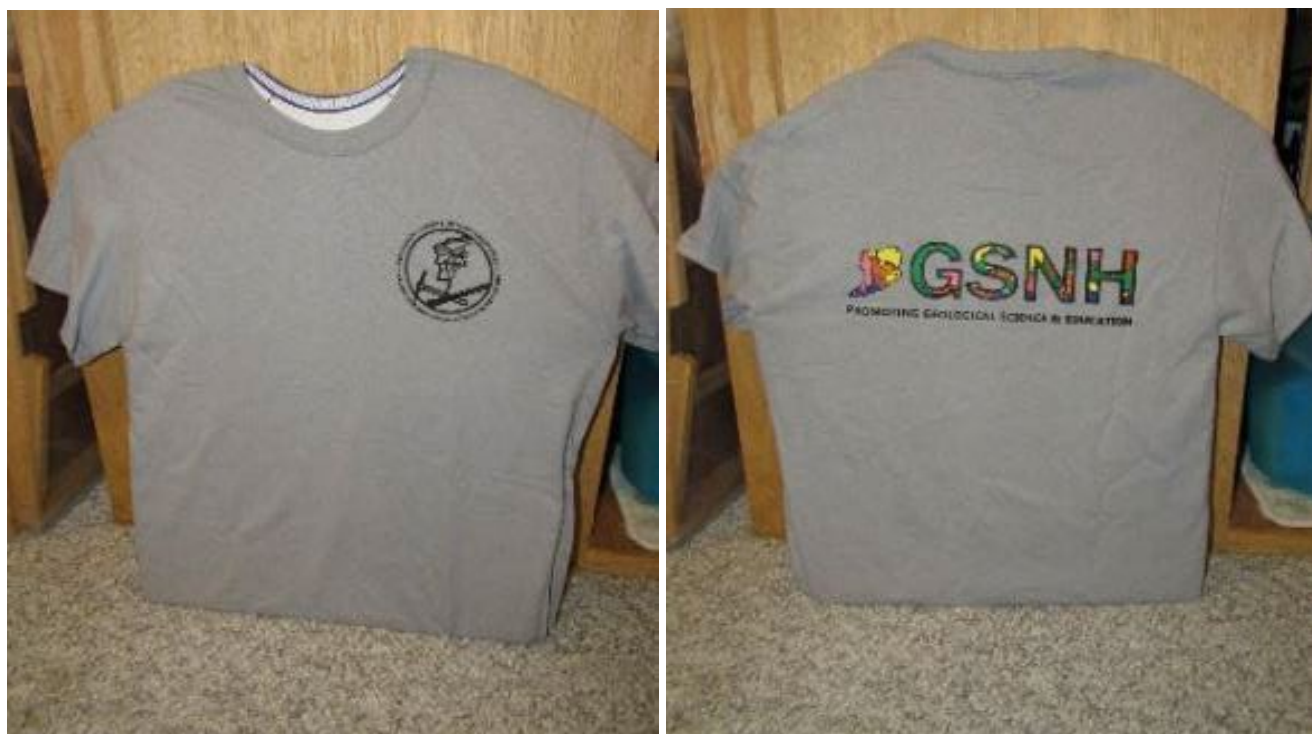
Front (left photo) and back (right photo) of GSNH t-shirt.

We have a few GSNH T-shirts still available – no XL, and we have just a couple in size L and a few more M and S sizes left. Send in your order before they're gone! T-shirts will be shipped to you. See order form on second to last page (right before the renewal form).