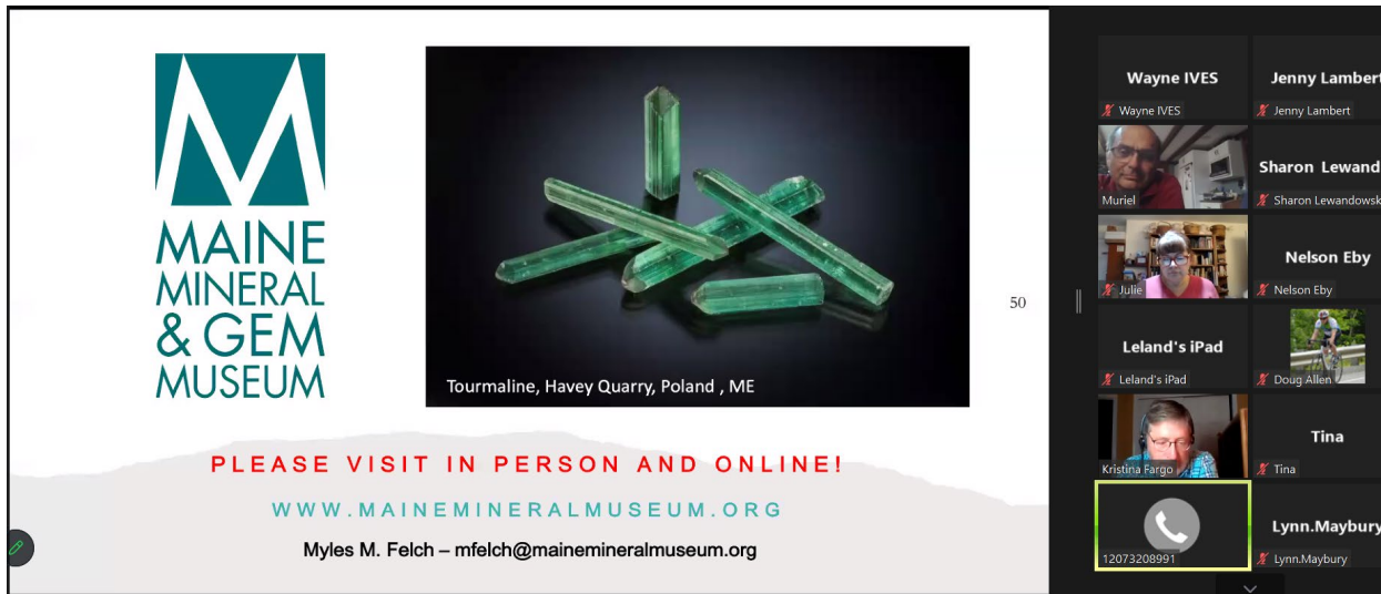
Example screenshot from the April presentation.